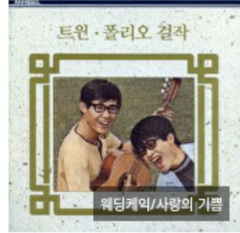
트윈 폴리오 걸작 (웨딩케익의 트윈 폴리오)