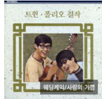
트윈 폴리오 걸작 (웨딩케익의 트윈 폴리오)