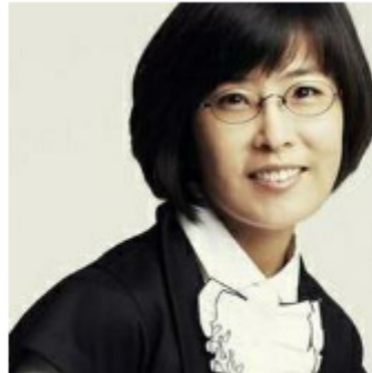
2011년 콘서트 실황 이선희